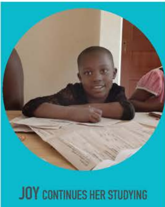
JOY CONTINUES HER STUDYING