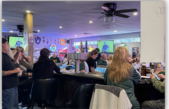
Knights of Columbus patrons enjoying the Packer Game, but next year we need a win!