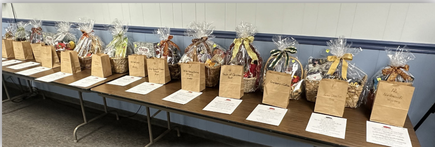
Just some of the nearly 30 raffle baskets donated for the event.

This fall, special thanks to the Knights of Columbus-South Milwaukee for once again hosting the Annual Harvest Food Drive & Pork Roast on November 2nd with proceeds benefiting Okoa Toto.